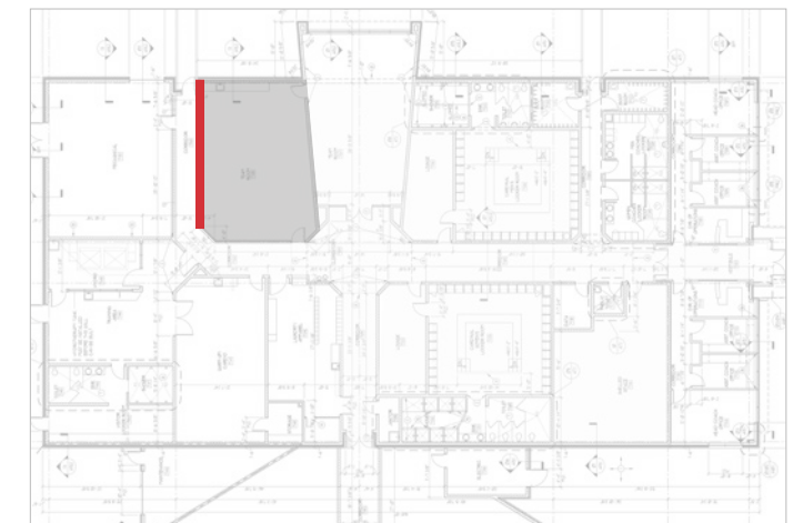
LOCATION // LEVEL 1