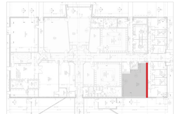
LOCATION // LEVEL 1