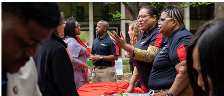
CODRE Open house on the Quad