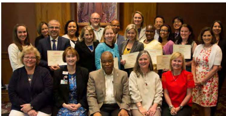
May 25th, Deans Forum Group photo

Respectfully submitted by members of the Faculty Concerns Committee