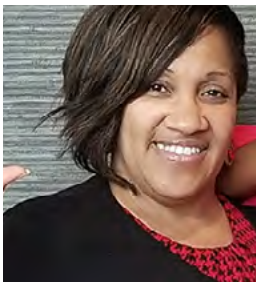
Marian R. Vasser - Presidential Exemplary Multicultural Engagement Staff Award