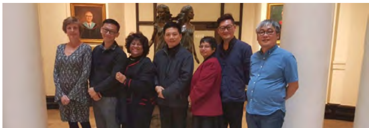
Attendees at the Film Festival.