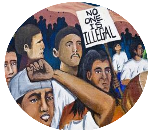
Undocumented, Not Illegal: Beyond the Rhetoric of Immigration Coverage , nacla, http://nacla.org/news/2011/12/30/undocumented-not-illegal-beyond-rhetoric-immigration-coverage (last visited Apr. 9, 2017).

“Illegal immigrant” or “illegal alien” are never acceptable terms to use. Both terms are dehumanizing and incorrectly imply that