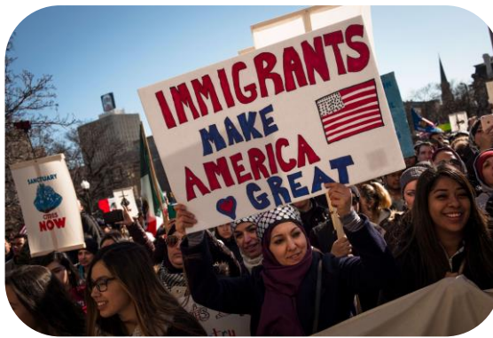
7 Things Americans Love That Were Invented By Immigrants, Complex, http://www.complex.com/life/2017/02/things-americans-love-invented-by-immigrants (last visited Apr. 9, 2017).

Following the 2016 election, the mainstream print media in Kentucky, Indiana, Ohio, and Tennessee for the most part reported on noncitizens in a positive light. 31 The majority of the reports focused on the uncertainties, fears, and hardships that noncitizens and refugees were facing and are continuing to face in light of the November election and what the local communities are doing to mobilize and help alleviate some of those fears and uncertainties. 32 The terminology used to describe the immigrant community was humane and non-offensive. 33 In particular, Louisville and Bowling Green seemed to be very serious about finding ways to help solve the problems facing the local noncitizen community. 34