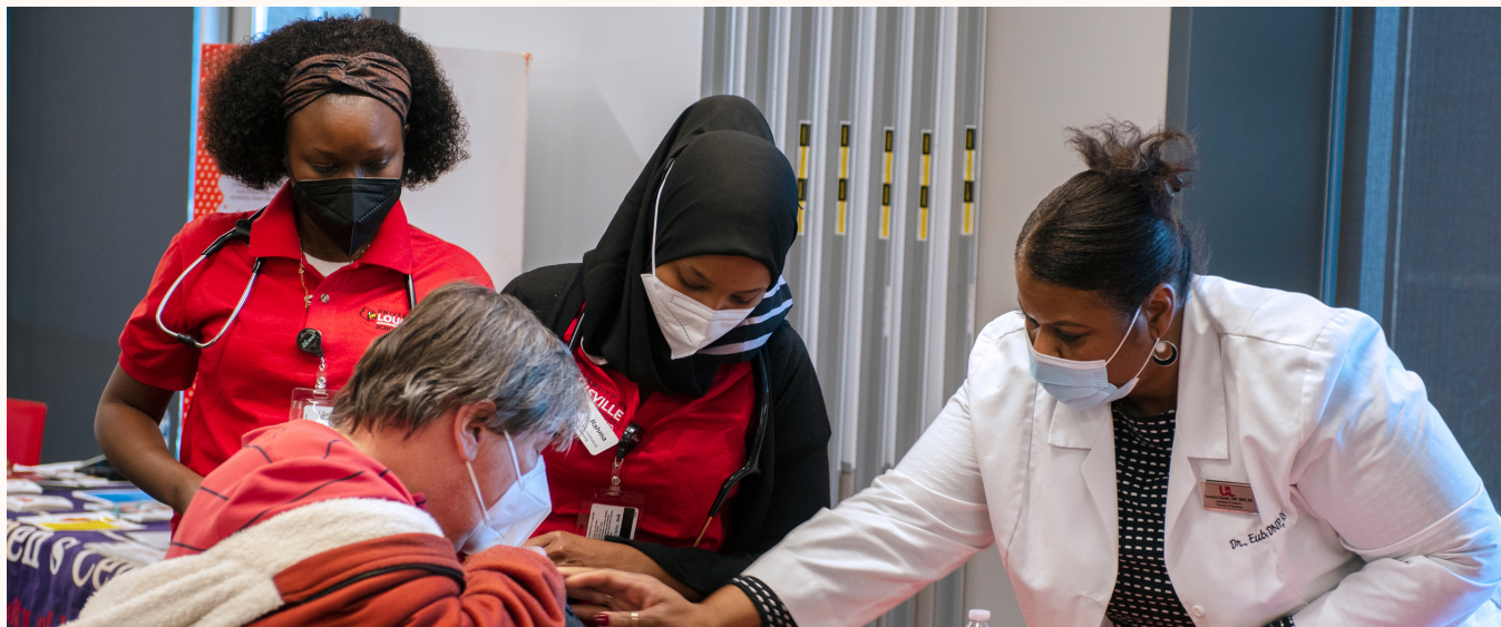
University of Louisville Wear Red Day February 10, 2022

Produced by the University of Louisville's Women's Center