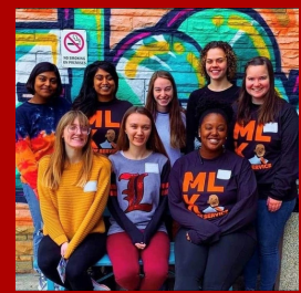
United Nations Association - Women at UofL students volunteering at Americana Community Center

At the University of Louisville, we celebrate by not only highlighting and advocating for women on campus as well as globally, but also recognizing the barriers women continue to face. Support UofL Women initiatives .