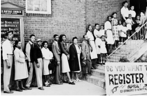
The Voting Rights Act of 1965 is a landmark piece of federal legislation in the United States that prohibits racial discrimination in voting.