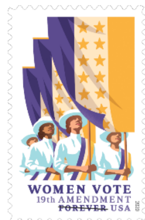
USPS 19th Amendment: Women Vote Forever Stamp

U of L Red Barn, (Resource Fair, 5 p.m.); candlelight service following the resource fair.