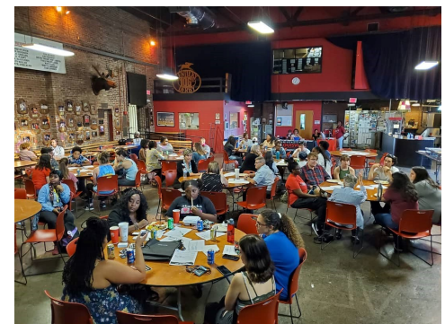
UofL Women's Center's "Cost of a Vote" event exploring the suffrage movement and those who still face barriers to vote today.

Student Activities Center (Multipurpose room), 9:00 a.m.-4 p.m.