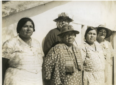
Native American women did not become citizens (and eligible to vote) until 1924 - four years after the ratification of the 19th amendment. Library of Congress.

The Women's Center and Commission on the Status of Women will be hosting a celebration and reflection on the passage of the 19 th Amendment and Voting Rights Act as part of the Speed Museum After Hours series. Reprising "The Cost of a Vote" panel discussion highlighting the barriers to