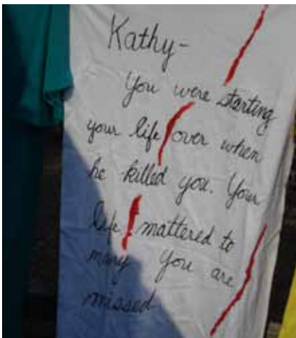
This photo is from a Domestic Violence victim on display at the Take Back the Night Event in September at UofL.