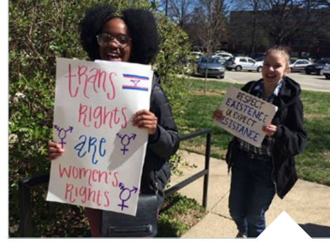
AAUW at the Women's Unity March