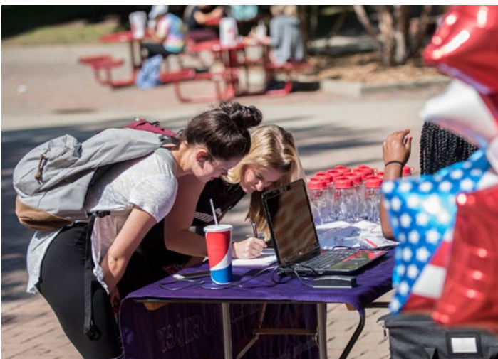
Students signing in at the Women's Center table during the 25th Birthday Party Celebration at the Red Barn on Aug. 24, 2017.