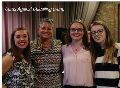
Cards Against Catcalling event.