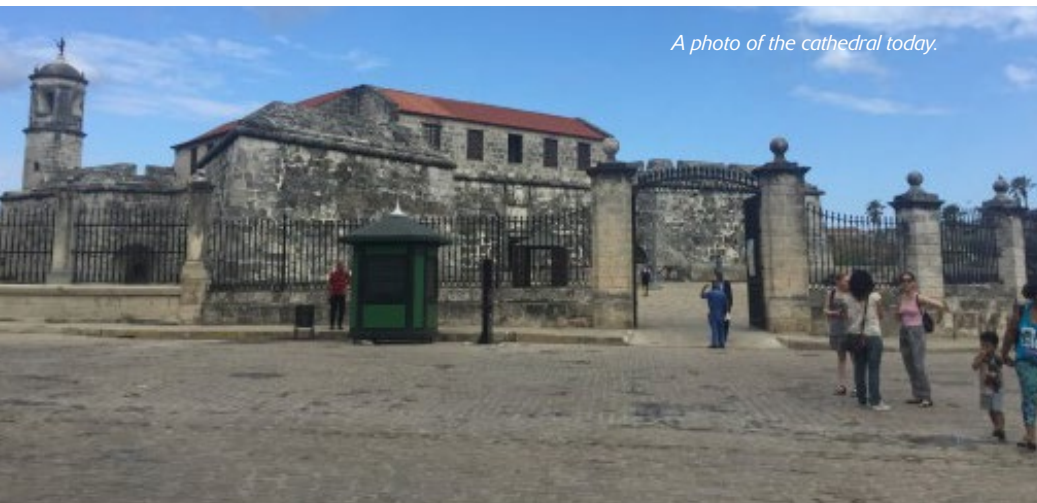
A photo of the cathedral today.

The Havana Square of the Revolution was built during the rule of Batista, which was renamed by former President Castro as Revolution Square. The square is filled with landmarks and architectural features such as fortresses. One of the most popular