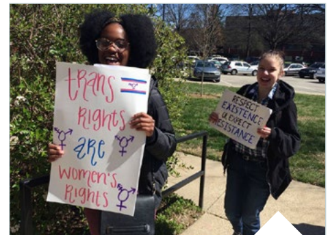
AAUW at the Women's Unity March