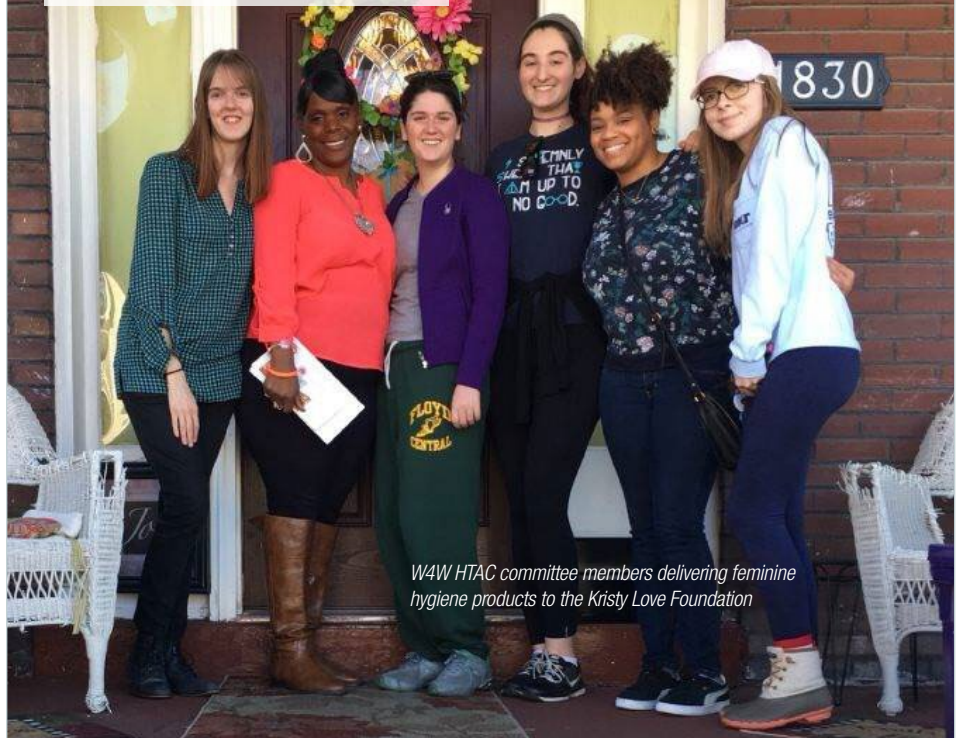
W4W HTAC committee members delivering feminine hygiene products to the Kristy Love Foundation

The following photos are from some of the events sponsored by the Women Center student groups over the past year.