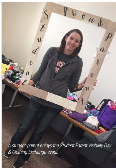
A student-parent enjoys the Student Parent Visibility Day & Clothing Exchange event.