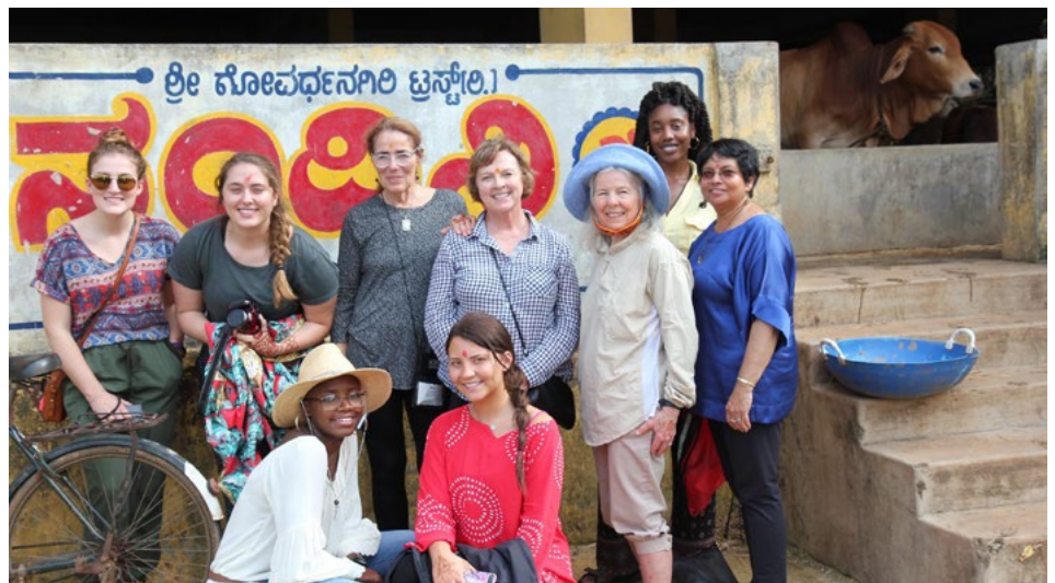
The UofL Women's Center partnered with the Department of Communication on a Global Trip to India this past summer 2017.