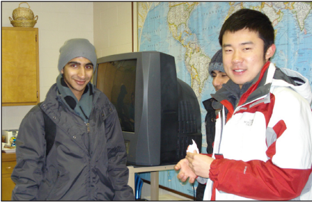
Students at the International Tea hosted by the Women's Center in January.