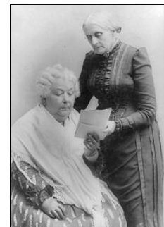
Elizabeth Cady Stanton (Seated) Susan B. Anthony