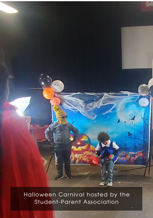
Halloween Carnival hosted by the Student-Parent Association