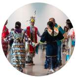
NATIVE AMERICAN HERITAGE MONTH