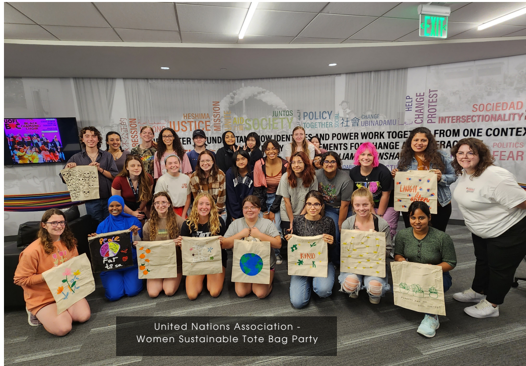
United Nations Association - Women Sustainable Tote Bag Party