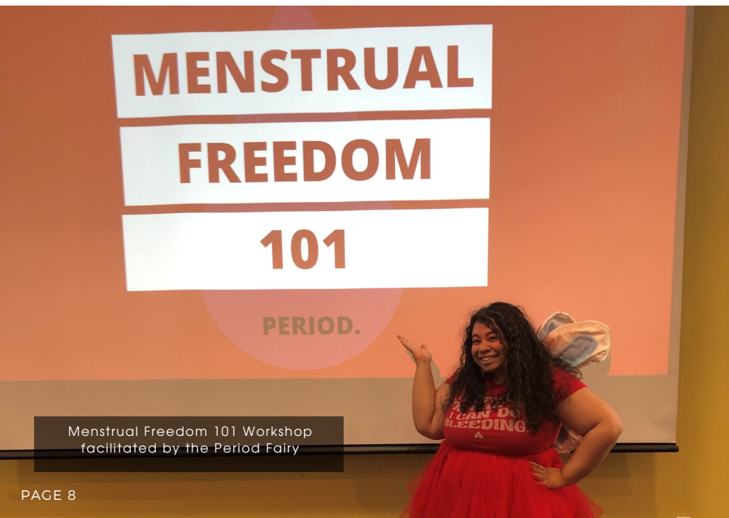
Menstrual Freedom 101 Workshop facilitated by the Period Fairy