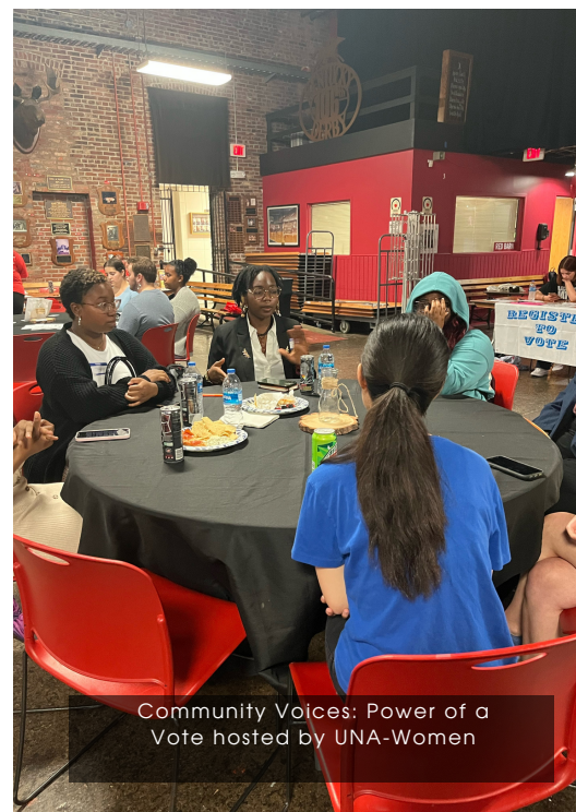
Community Voices: Power of a Vote hosted by UNA-Women