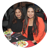
DR. M. CELESTE NICHOLS AWARD