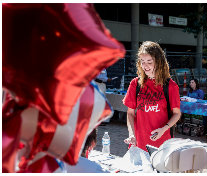
Black women and women of color were NOT guaranteed the right to vote until the Voting Rights Act of 1965.