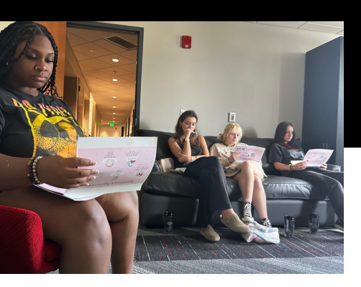
Feminist Social Justice Leadership Living Learning Community Welcome Event Aug 17th, 2023