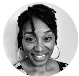
MESSAGE FROM THE DIRECTOR