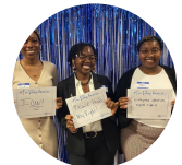
ADVOCACY IN ACTION