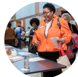
18TH ANNUAL KENTUCKY WOMEN'S BOOK FESTIVAL