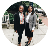
MORE WOMEN'S CENTER SCHOLARSHIPS!