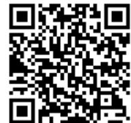
More info about Cardinal Core