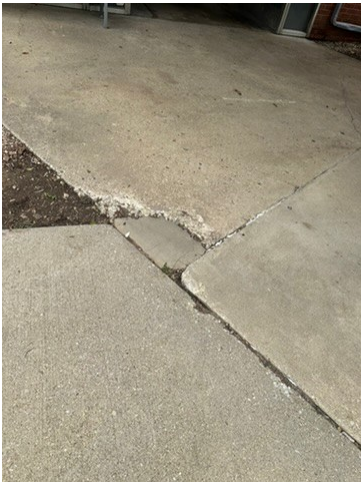
Sidewalk between Schneider and BAB