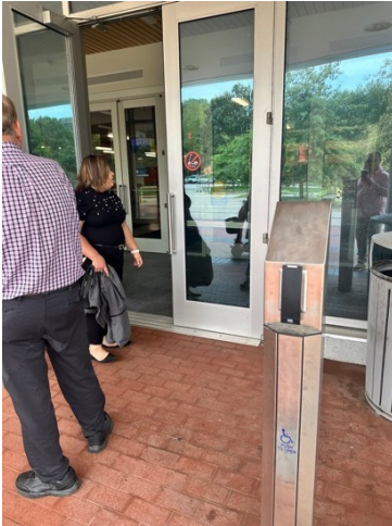
ADA Door on Front of BAB was locked and would not open with the button.