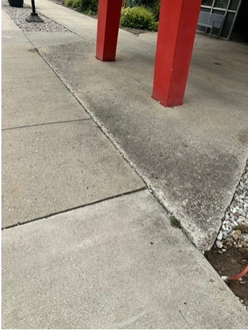
Sidewalk between Schneider and BAB