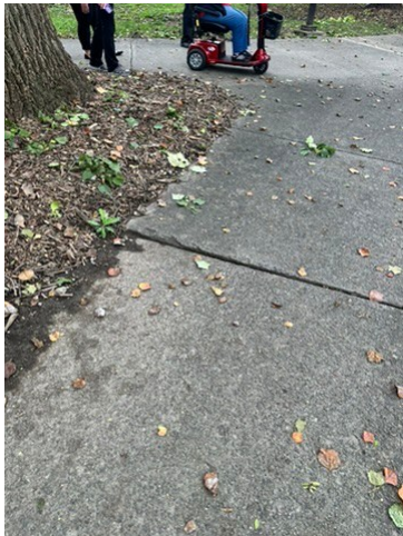
Sidewalk near Gottschalk