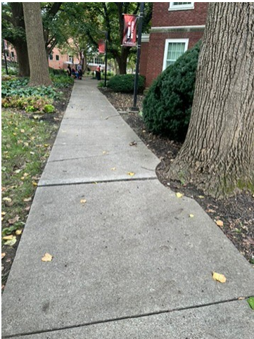
Sidewalk near Grawemeyer