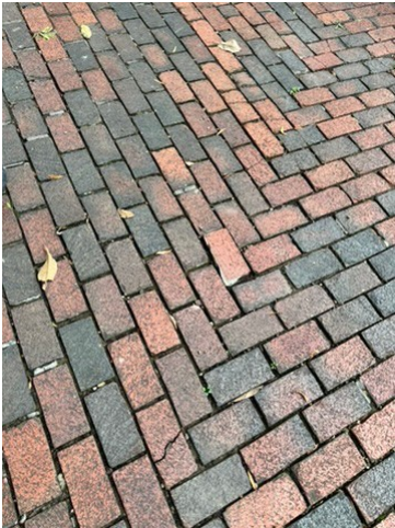
Brick in Strickler Court