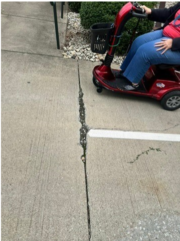
Sidewalk between Schneider and BAB