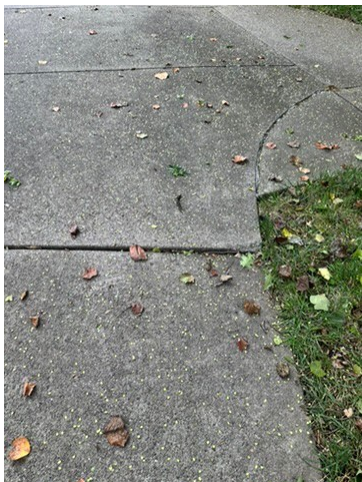
Sidewalk between Gardner Hall and Grawemeyer near Schneider Hall