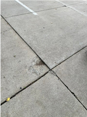
Sidewalk between Schneider and BAB