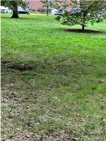
Hole in grassy area near Grawemeyer