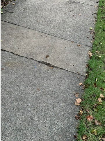
Sidewalk between Gardner Hall and Grawemeyer near Schneider Hall