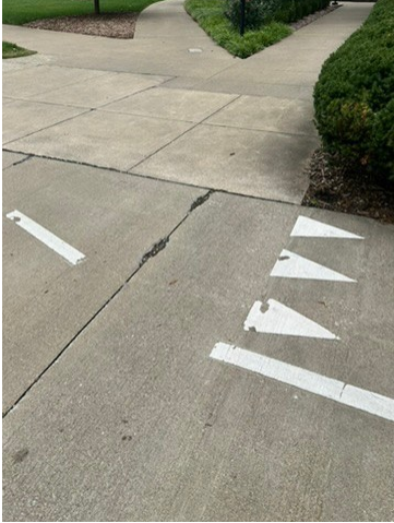
Sidewalk between Schneider and BAB