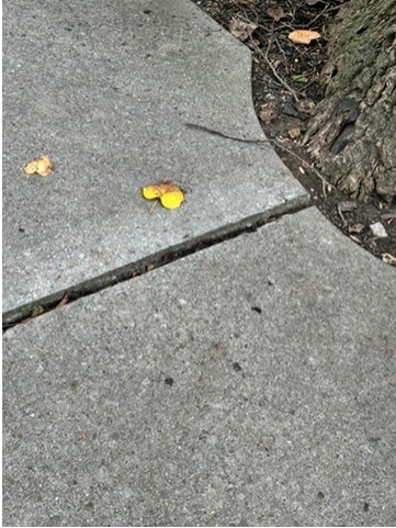
Sidewalk near Grawmeyer