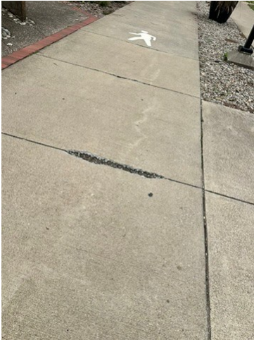
Sidewalk between Schneider and BAB