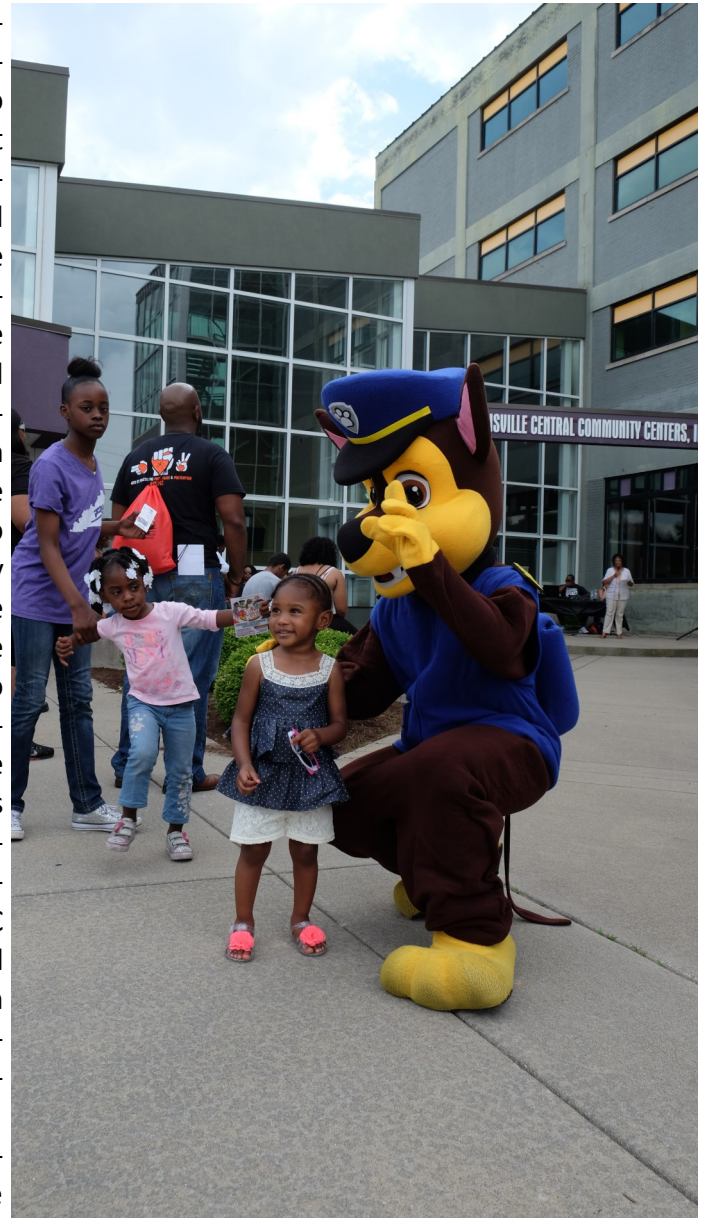
Louisville's crime prevention mascot was in attendance and welcoming photo ops.

YouTube videos, television commercials, radio ads, neighborhood billboards, bus shelters, print ads, the campaign website, and social media platforms using #YVPRC. This particular media effort concludes at the end of December 2017; the overall Pride, Peace, Prevention campaign continues through spring 2020.