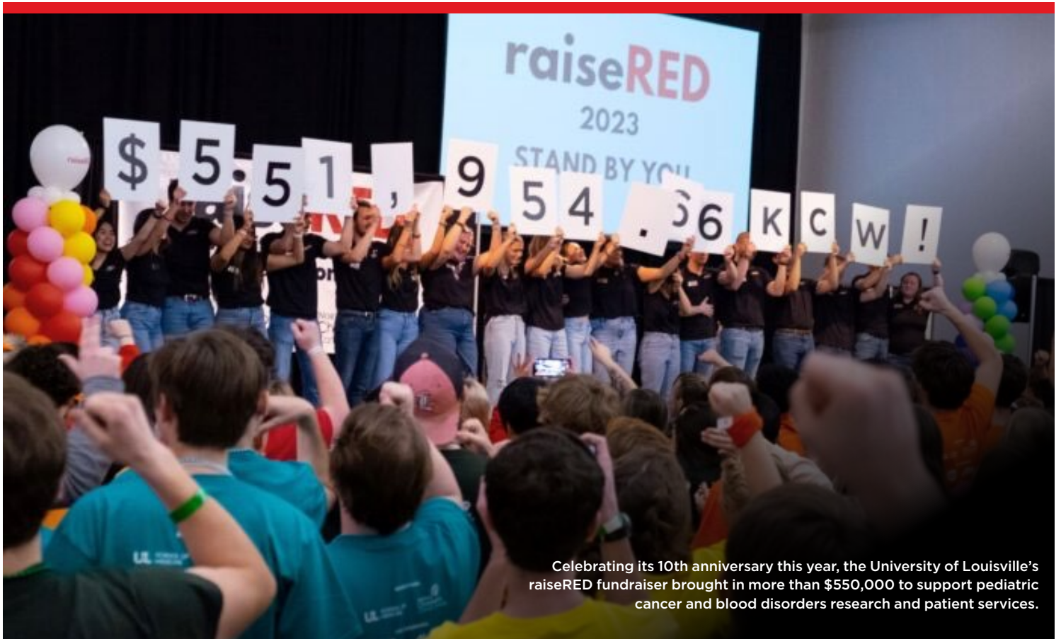
Celebrating its 10th anniversary this year, the University of Louisville's raiseRED fundraiser brought in more than $550,000 to support pediatric cancer and blood disorders research and patient services.