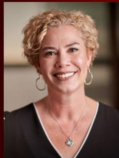
2022 - LAW