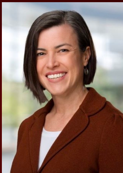
2023 - A&S