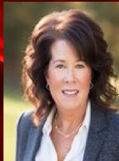
2024 - NURS