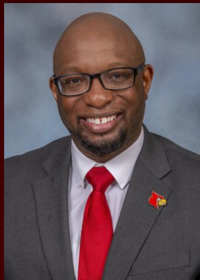
2023 - SWFS