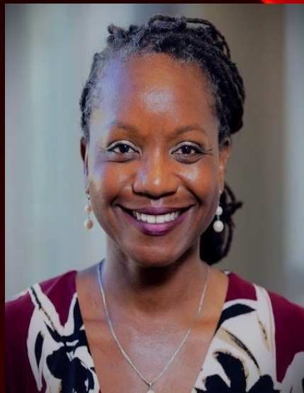
2024 - CEHD