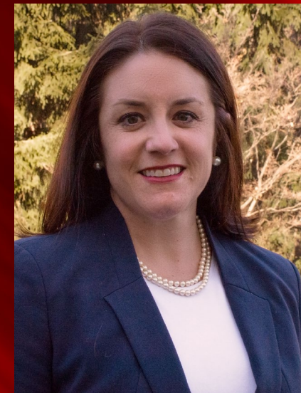
2024 - SPHIS