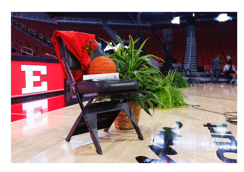
Celebrating a Life Well-Lived