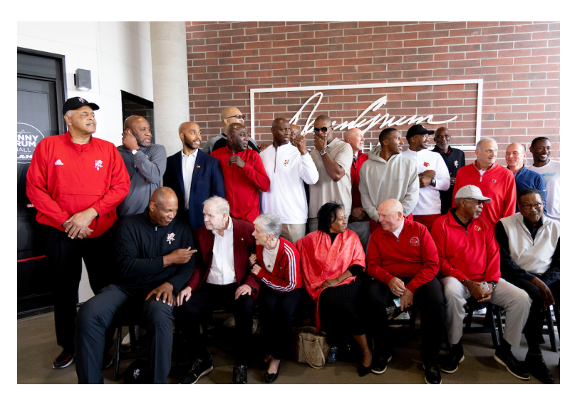
Expanding Alumni Engagement