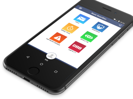
See louisville.edu/cardsafety/ for details on app download and text alerts.