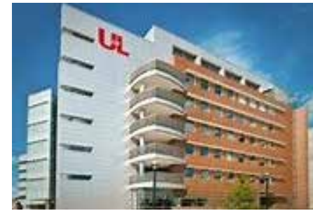
Clinical and Translational Research Building