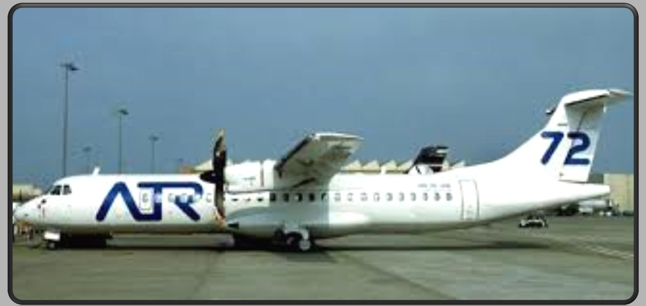
This is the same type of aircraft that was involved in the crash.

The image on the right depicts icing on the wings of a plane – the 0-20 degree C is what would have occurred on this particular flight.