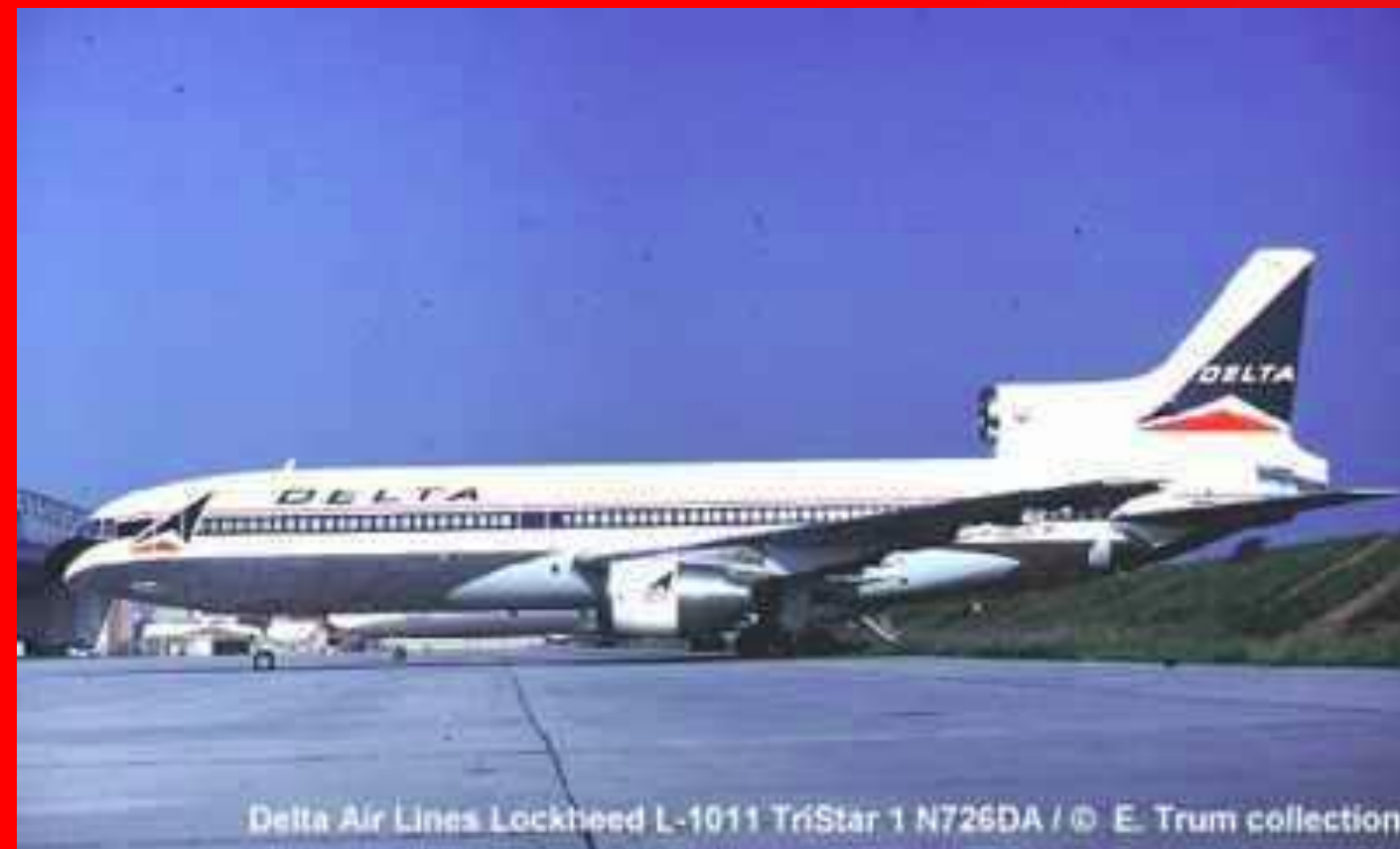
Delta Air Lines Lockheed L-1011 TriStar 1 N726DA

The thunderstorm produced a downburst which gave the aircraft a strong headwind upon descent causing the pilot to decrease thrust. As the plane passed through the center of the downburst, a strong tailwind hit it near the runway. The plane rapidly sped up and the pilot tried to slow it down to land. Once he realized they were moving too fast to land, he tried to pull up but it was too late. The aircraft crashed in a field, bounced in the air, and came down again on Highway 114, crushing a small Honda and killing the driver. Going at 220 knots, the plane also hit two 4 million gallon water tanks causing water to go everywhere and mass chaos for the first responders who came to help. 137 people died from this accident.