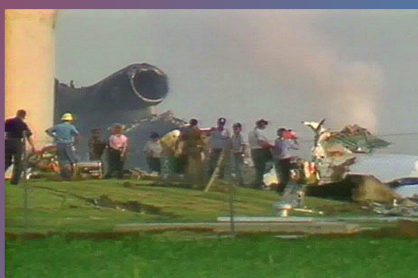
WFAA-TV Dallas, TX