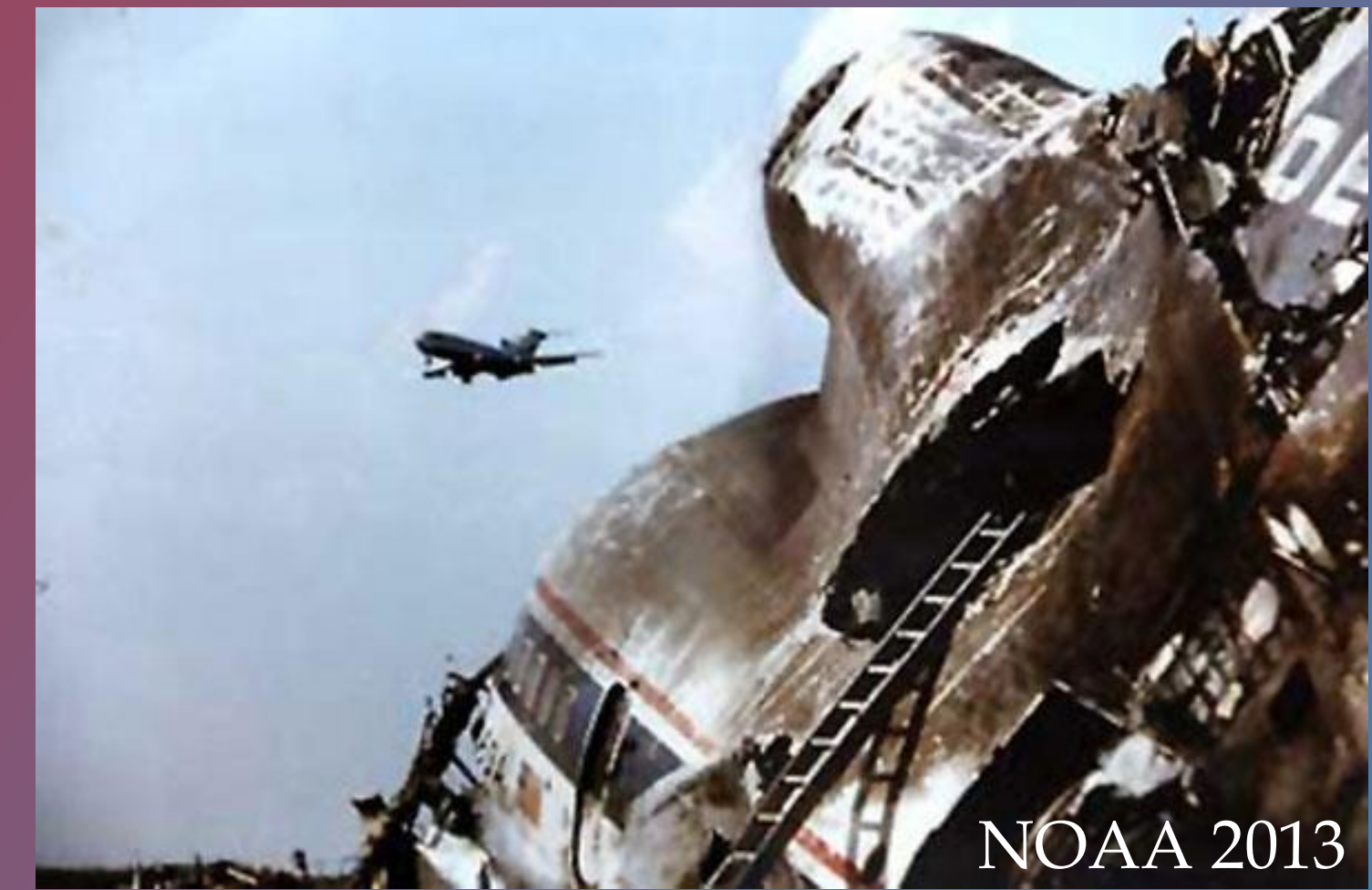
Wreckage of N726DA's tail section after a microburst slammed the aircraft into the ground. A Boeing 727 can be seen in the background flying past the crash scene. NOAA 2013