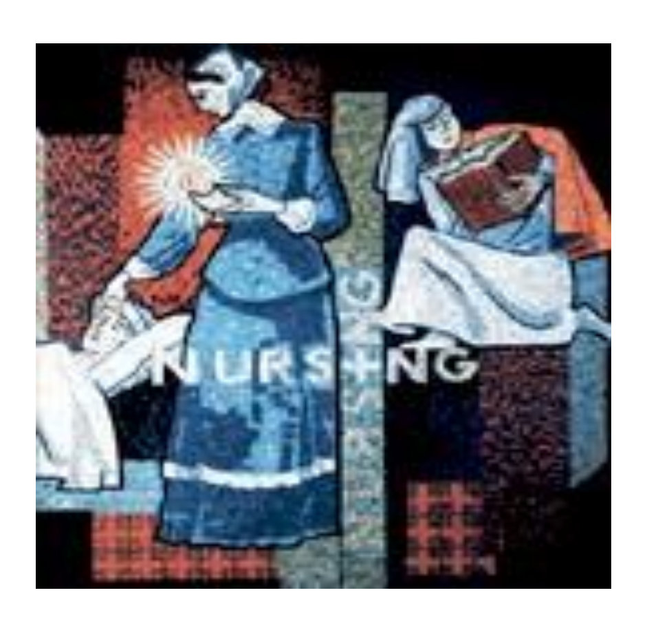
CLINICAL HANDBOOK SPRING 2018 – FALL 2019