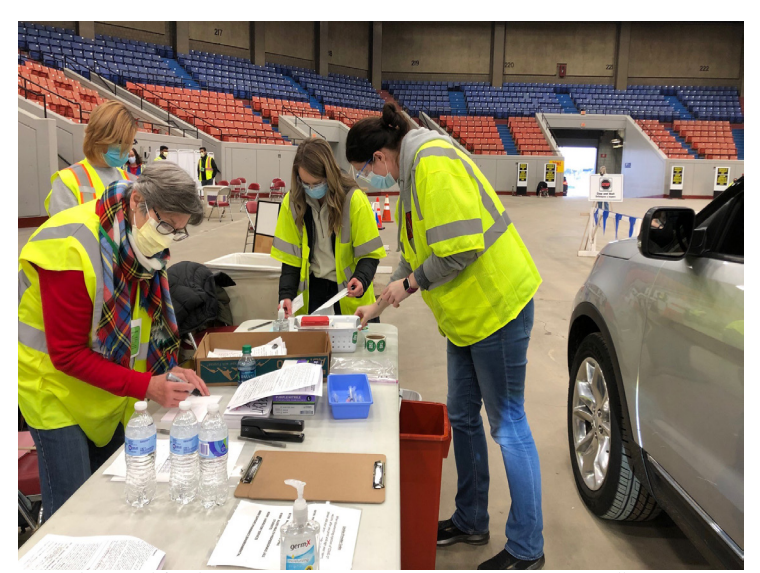
Students and faculty preparing to give COVID-19 vaccines at Broadbent Arena