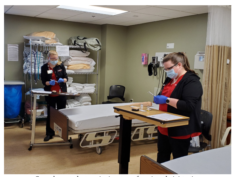
Owensboro students reviewing steps of vaccine administration