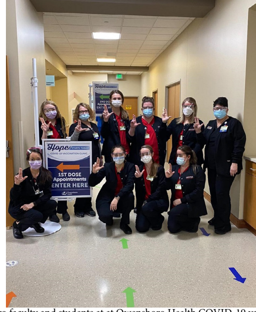
Owensboro faculty and students at at Owensboro Health COVID-19 vaccine clinic