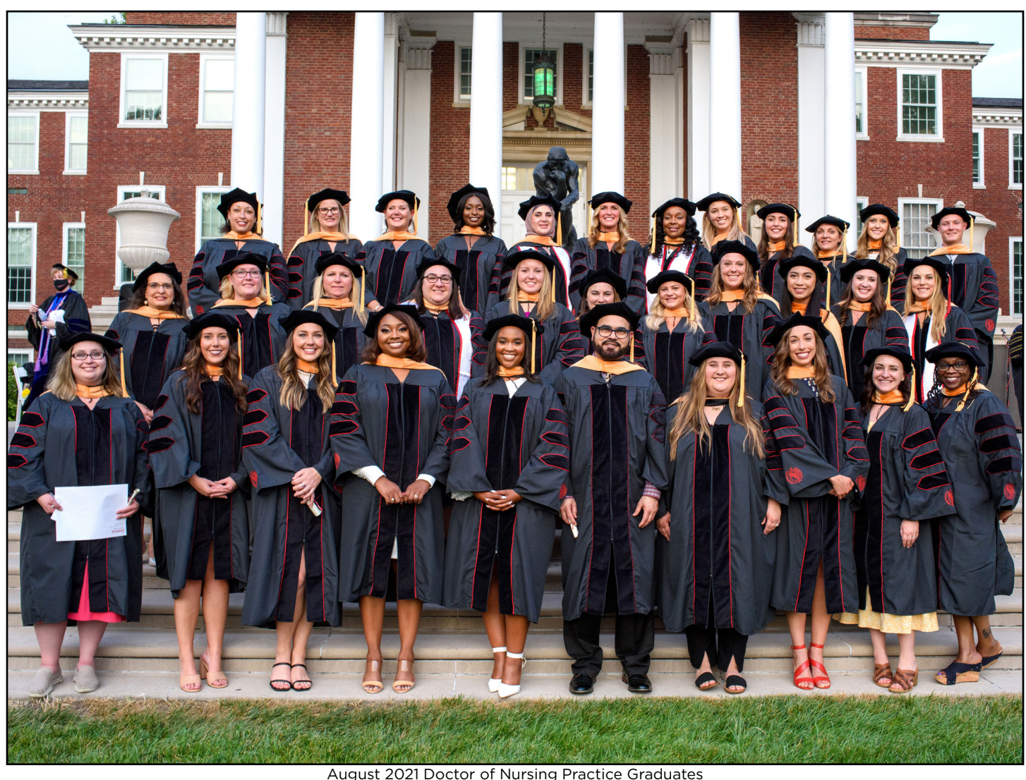
August 2021 Doctor of Nursing Practice Graduates