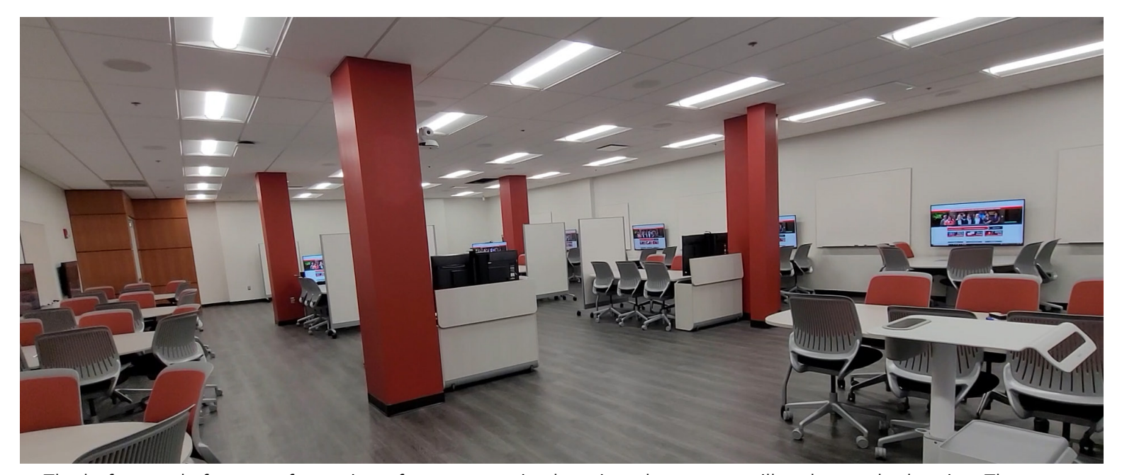
The before and after transformation of our new active learning classrooms will make you look twice. The rooms feature individual, large-screen table displays, wireless presentation/sharing capabilities, newline interactive touch displays, HD room cameras, and intelligent ceiling array microphones. There are also wall-mounted and portable whiteboards for brainstorming and reporting. Watch the transformation.