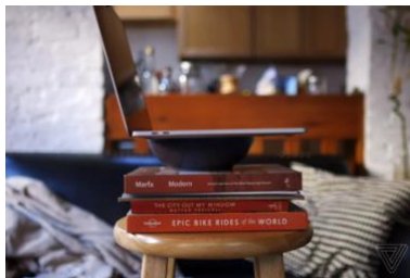
Prop up camera so it points straight at your face

If you are using your built-in webcam prop your laptop up on something (such as a stack of books) to raise the camera. No one wants to look up at your nose they want to see you straight on.