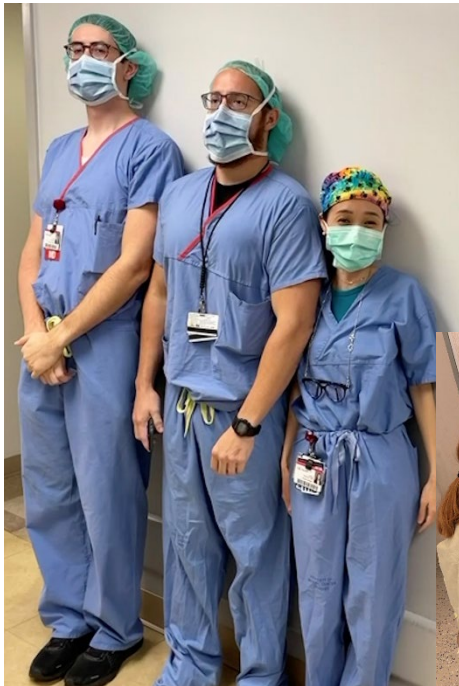
Our trainees come in all sizes!