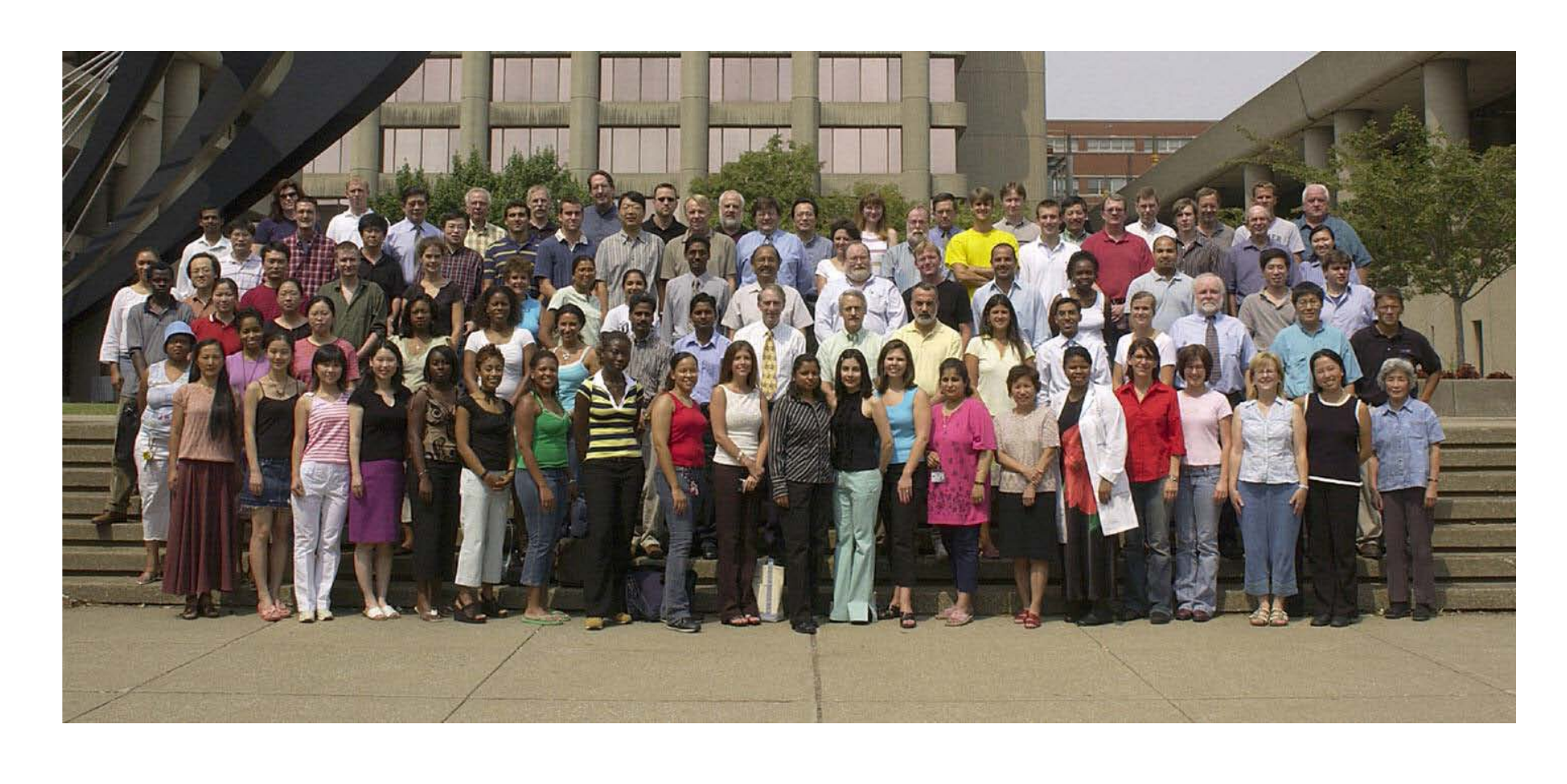
Department of Pharmacology and Toxicology-2005