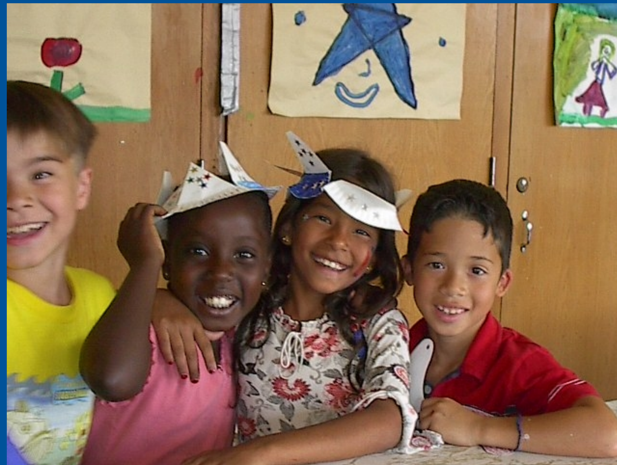
Refugee children at the Americana Community Center, retrieved from http://americanacc.org/

The need for reliable data systems to monitor refugee health has been well documented 3,4,5 . Woodland, Burgner, Paxton and Zwi recognize ten elements for good practice concerning refugee health including coordination of health care; intersectoral collaboration; data collection and evaluation; capacity building; and advocacy 6 . Despite these documented needs, little research concerning the effects of improved data collection on health outcomes has been conducted. This research project documents initial improvement in data collection from a data coordination process and demonstrates the impact and importance of collaboration between government and academia.