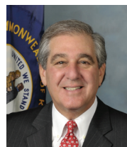
Honorable Jerry E. Abramson Lieutenant Governor Commonwealth of Kentucky, Frankfort, KY

Lieutenant Governor Abramson was elected Kentucky's Lieutenant Governor in November 2011. Before running for statewide office, Abramson was the longest-serving mayor in the city of Louisville's history, having won election to five terms, two of them during a merged city and county government. Throughout his 21 years as mayor, Abramson oversaw a dramatic transformation of Louisville and was known for creating public/private partnerships to further policy goals. In 2008, the US Conference of Mayors acknowledged Abramson's impact when it named Louisville "America's Most Livable Large City." Whether it's working with the private sector to create more jobs or ensuring educational opportunities are available for every citizen, Abramson supports Governor Steve Beshear's mission to make Kentucky the best state in the nation. A lifelong Kentuckian, Abramson received a BS in business economics from Indiana University and a law degree from Georgetown University in Washington, DC. Objectives: This session will describe kyhealthnow, the state's aggressive and wide-ranging health initiative. This initiative focuses on improving the health outcomes of Kentucky's citizens through various partnerships, resources, education, legislative action, and enrollment for insurance coverage. Lt Governor Abramson will provide information on the strategies of implementation and describe ways that physicians can participate.