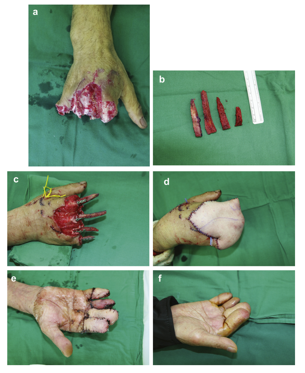
Figure 1 a. A 68-year-old male who suffered amputation of the right second, third, fourth, and fifth finger. b. A free iliac bone graft was harvested for all four fingers. c. The harvested bone grafts were fixed to the remaining proximal phalanges with miniplates. d. The latissimus dorsi perforator flap covers all the digits and the grafted bones circumferentially out to their distal tips. e. Debulking and division were performed four weeks later. f. Metacarpophalangeal joint function was saved, and the patient was able to grasp and pinch objects six month after surgery.

method.<sup>21-23</sup> When thumb function is saved, the most important goal for hand reconstruction is the ability to pinch or grasp. From that viewpoint, second- or third-finger reconstruction should be considered.