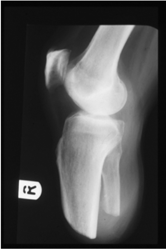
Figure 1 Well-fashioned transtibial amputation.

Soft tissue coverage with local tissue flaps and avoiding skin grafts is ideal when this can be achieved. The balance between agonist and antagonist muscles is important to avoid future joint contractures and problems with prosthetic prescription. Neuroma formation is not uncommon in amputees, and while they may not always be symptomatic, when they are, prosthetic comfort is compromised which impacts on function requiring excision of the neuroma.