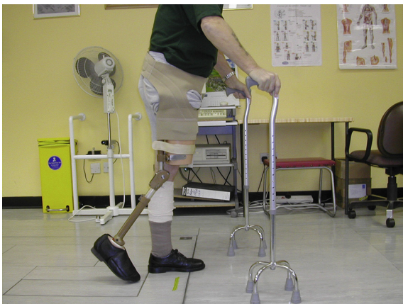
Figure 4 Walking with an early walking aid.

During this phase an amputee is assessed for a definitive prosthesis and suitable goals are agreed. Co-morbidities potentially causing insufficient cardiorespiratory function, neurological conditions resulting in physical and cognitive deficits are carefully considered as these can impact on walking. 10 For patients with bilateral transfemoral amputations foreshortened prostheses are used to determine the patient's ability to progress to standard full-length prosthetic prescription. The patient's height is much shorter using these specialized prostheses making the patient's centre of gravity lower resulting in better balance and stability in gait training (Figure 5).