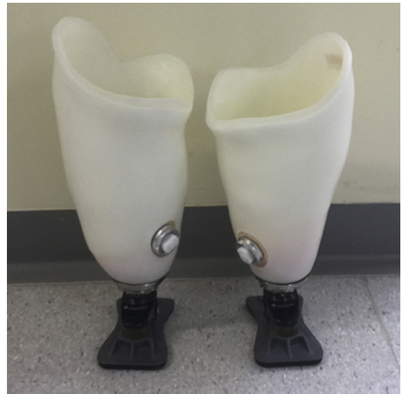
Figure 5 Stubbies.

Following successful fitting of the prosthetic limb, the amputee will continue rehabilitation, often for several months, aiming for independent donning and doffing of the prosthetic limb, gait re-education, progressing to maximum independence with activities of daily living and mobility.