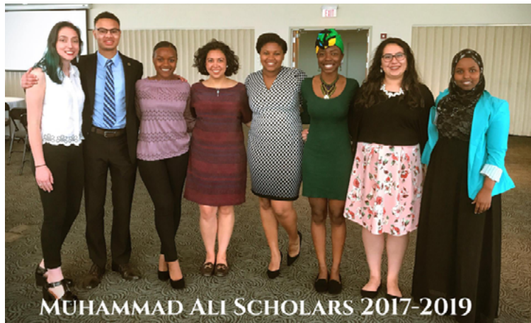
Muhammad Ali Scholar Graduation and Induction Ceremony (April 2017):