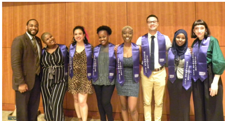
April 2019: Muhammad Ali Scholar Graduation Ceremony.