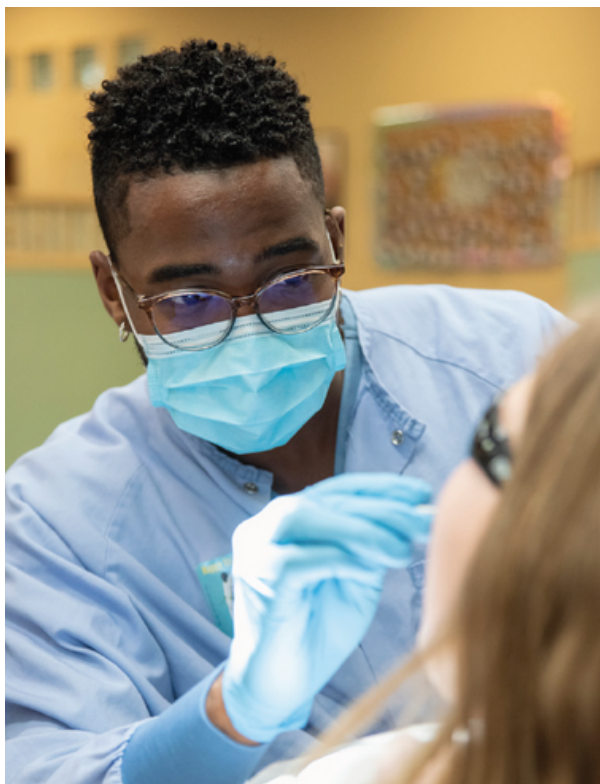
SHPEP student performing a dental exam