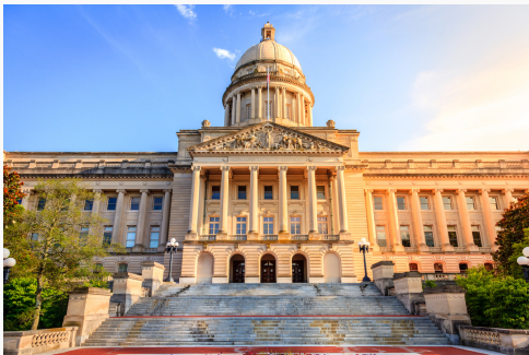
Kentucky State Capitol Building