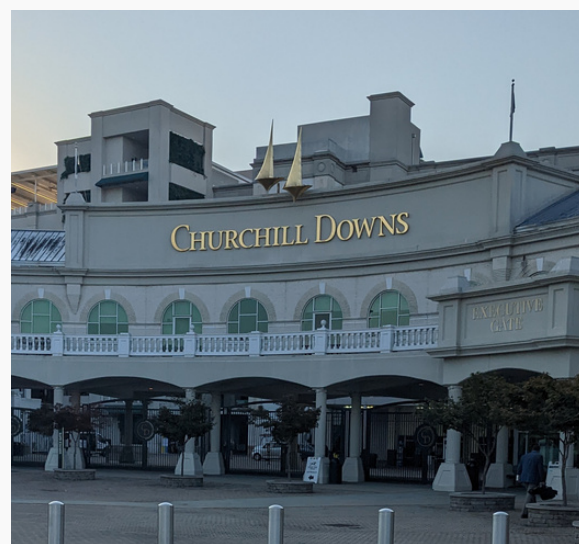
Churchill Downs Executive Gate

Whatever charity Churchill Downs provides, between the racetrack and the conglomerate, they appear to be missing the mark of helping to improve the immediate vicinity on these measures. True enhancement and invigoration would bring these areas out of the red. It would make these neighborhoods as popular as the famous attraction that people flock to every May. And it would greatly improve the outcomes and opportunities for the residents.