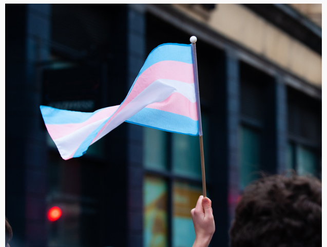
Trans Pride flag waving