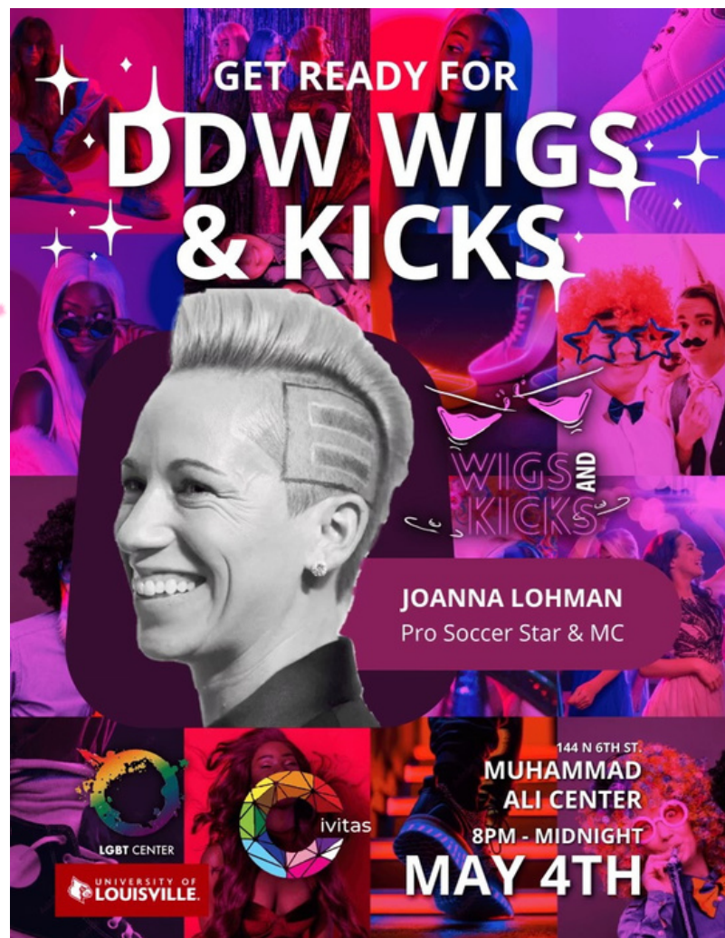
Flyer for Derby Diversity Week Wigs & Kicks Party

**A portion of the proceeds benefit the LGBT Center**