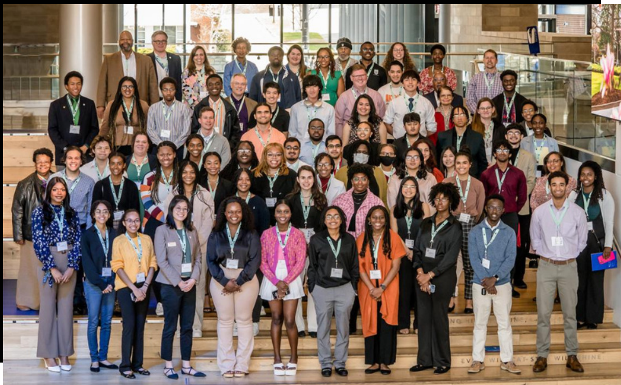
LSAMP participants and staff