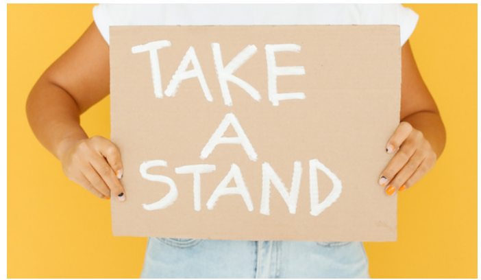
Person holding a sign that reads "Take a Stand"