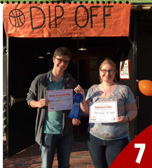
Image: Winners of last year's Dip Off Competition.

Thursday, March 30 5:30-7:00 PM • Red Barn