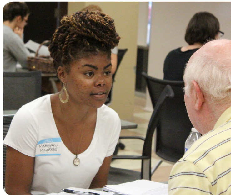
Images: [Top] Student listening to faculty feedback during a Fall 2016 Fulbright Workshop. [Bottom] Student and Faculty during a Fall 2015 Fulbright Workshop