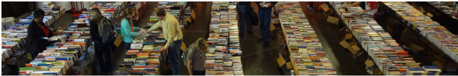
Help us fill Red Barn again!

If you have any questions, feel free to email HonorsBAMS@gmail.com or visit our website, www.uoflhsc.com .