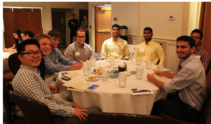
Images: Students at the Fall 2015 Seminar Showcase. All scholars are invited to have dinner and learn about Honors Seminars for the following semester. Don't miss your chance to participate - apply this semester!