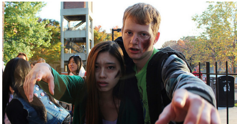
Turn into a zombie at our Zombie photobooth!