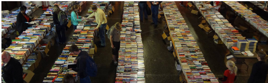
Help us fill Red Barn again!

If you have any questions, feel free to email HonorsBAMS@gmail.com or visit our website, www.uoflhsc.com .