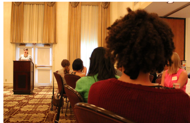
Top: (Left) Students sign in for the event. (Middle & Right) Students mingle at their tables before the presentations. Bottom: (Left) Light refreshments were served during the presentations. (Middle & Right) Professors give more information about their upcoming seminars.