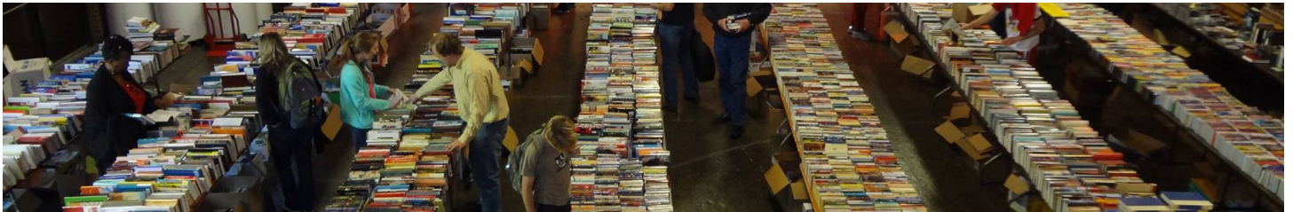
Book and Media Sale (BAMS) 2014, Red Barn

Attention honors students and faculty-- it's that time of year again! BAMS, Honors Student Council's bi-annual Book and Media Sale, is right around the corner and we need your help. In order to make this event happen we really need for you to donate any of your old, gently-used books, DVDs, video games, and/or CDs to the Honors Etscorn Center by no later than Friday, March 25, 2016 . Trying to purge your book collection back down to a manageable size? We'll gladly give you a hand. Looking for a way to get rid of some of your dad's old records? Bring them here-- your mom will thank you later. Honors Student Council wants to make this Book and Media Sale bigger and better than ever before, but we can't do it without you. So please donate, donate, donate! The event is scheduled to take place during the week of April 3, 2016, and all of the proceeds will go towards helping Camp Quality Kentuckiana . If you have any questions please feel free to email HonorsBAMS@gmail.com or visit our website, www.uoflhsc.com .