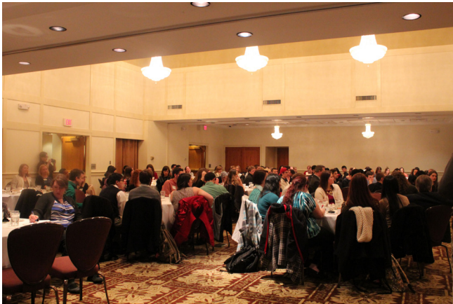
Lots of students and professors attended the Honors Scholar Showcase.