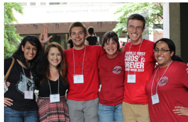
The student assistants were wonderful and dashing as always!