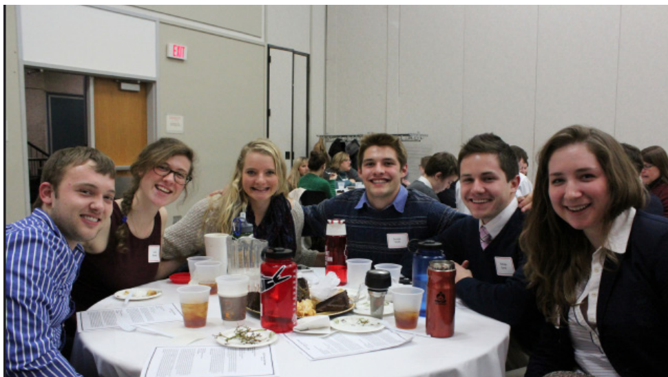
Students posed for a picture at last semester's Scholars banquet.