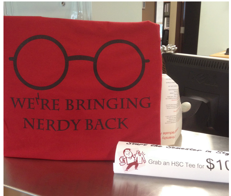
Do it for Dumbledore.

HSC T-Shirts are in! They are available for purchase for $10 in the Etscorn Honors Center. If you want to bring nerdy back, you should purchase one of these shirts.