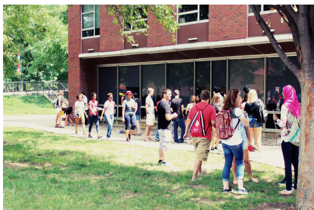
Students met outside of the Etscorn Honors Center to walk to the seminar together.

The invigorating two day start to the freshmen seminar began on Wednesday, August 20 and closed on August 21. The course will continue for freshmen Honors students through the first five weeks of classes.