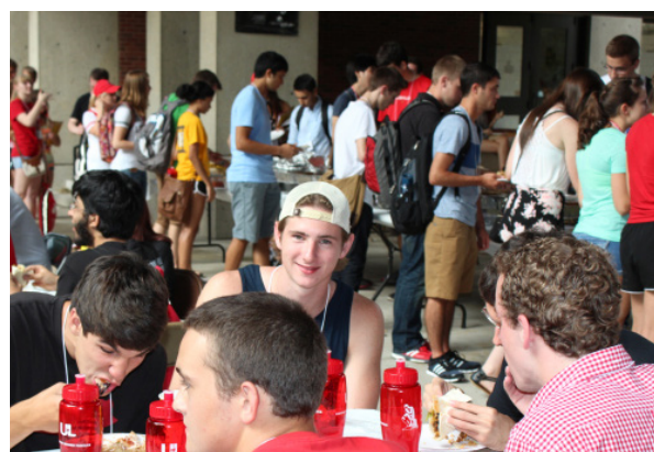
Lines were long but the spirits were high as the students went on a dinner break.