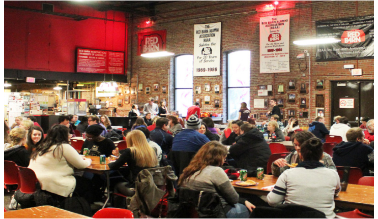
Last semester's Trivia Night was a huge success with over 100 people coming out to compete.

Everyone is invited to test their knowledge at Honors Student Council's Trivia Night! Trivia Night is a signature event of Honors Student Council. People of all ages are invited for some fun competition and to play for the chance to win some great prizes! Trivia Night is October 15 at 6:00 in the Red Barn. Bring your A game!