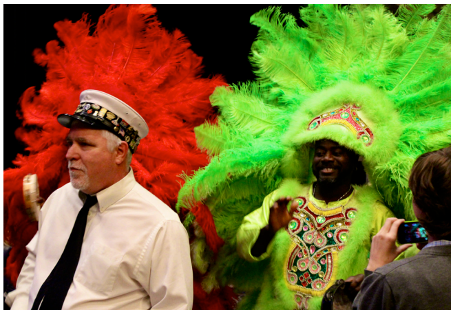
Conference participants enjoyed Mardi Gras celebrations and delightful live music all weekend.