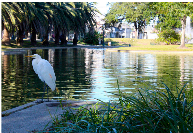
Students from UofL made some friends in warm Louisiana, including this (slightly terrifying) heron in the Louis Armstrong Park.