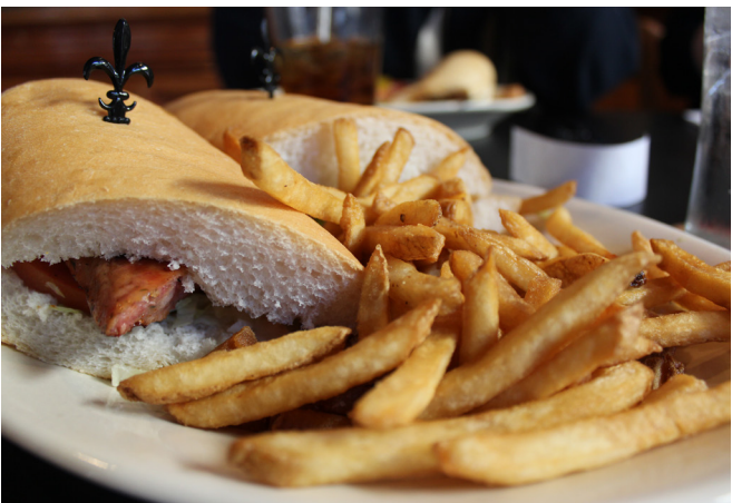
There is no city like New Orleans in terms of food! Shown above is a delicious alligator po' boy.