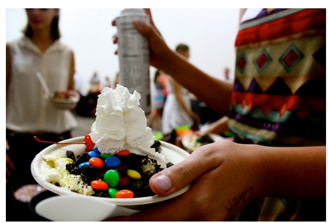
Emily Benken showing off her colorful creation.