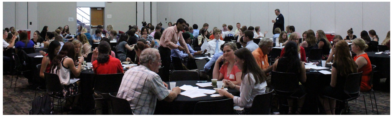
The Student Activities Center was filled with well-dressed Honors Scholars and ice cream (not to mention M&Ms, Oreos, whipped cream, cherries, strawberries, and syrup!).

For more pictures, make sure to view the Honors Facebook page, www.facebook.com/LouisvilleHonors.