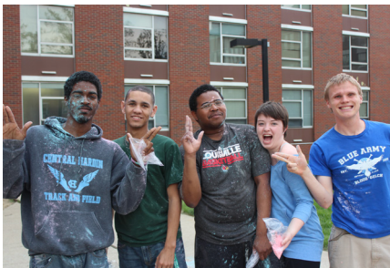
Colorful powder made the event fun, festive, and just a bit messy!