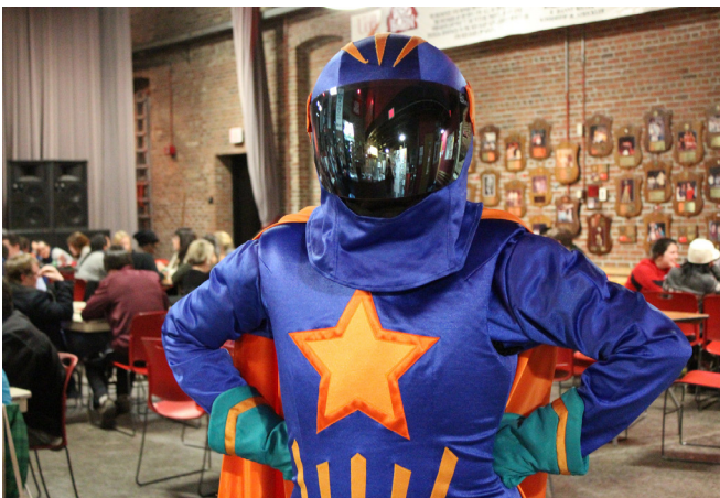
The BAMS Man (the official mascot of the Honors Student Council Book and Media Sale) was on hand to take pictures at Trivia Night.