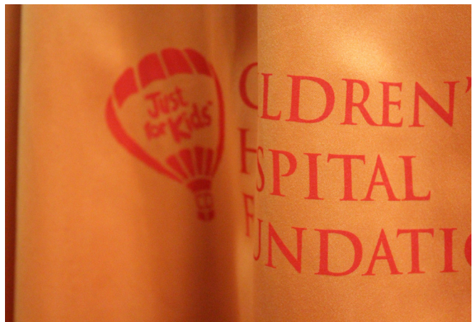
All money raised from Trivia Night will be added to the amount raised by the Book and Media Sale in April and donated to Kosair Children's Hospital!