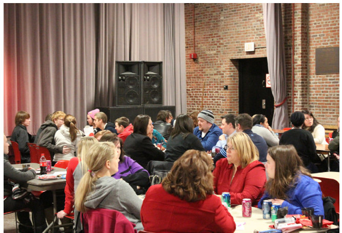
With almost 70 people from on campus and the community competing, this was the best attended Honors Student Council Trivia Night of all time!