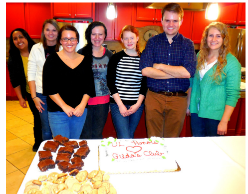
HVP hosting a meal for cancer survivors at Gilda's Club of Louisville on January 22.