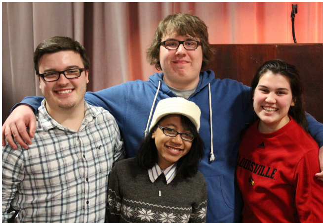
The winning Trivia Night team won not only bragging rights, but also several donated gift cards!

On Wednesday, January 29, Honors Student Council sponsored a Trivia Night full of great food, raffles, challenging trivia, and prizes--all raising money for Kosair Children's Hospital! For more pictures from this and future events, make sure to like the University of Louisville Honors Program Facebook page ( https://www.facebook.com/LouisvilleHonors ).