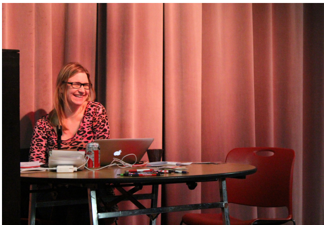
The Trivia Night was professionally hosted by Louisville Trivia, who graciously donated their time and services for the event.