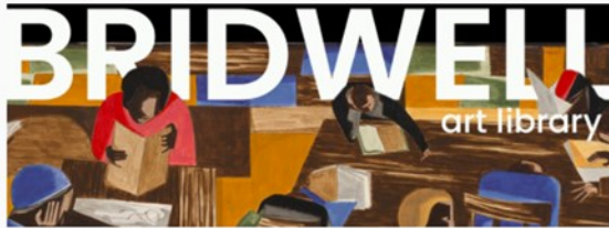
Jacob Lawrence, The Library , 1960, tempera on fiberboard.