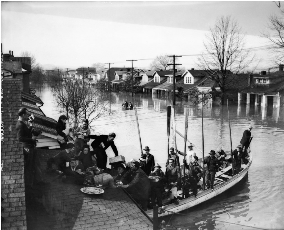
1937