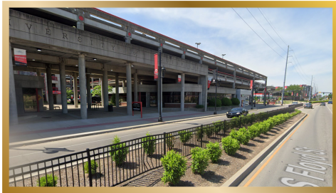
FLOYD STREET GARAGE 2126 S. FLOYD STREET | METERS AVAILABLE AT VISITORS ENTRANCE PULL IN (END OF GARAGE)

If you need to park on campus, you can get a parking permit either at the Belknap campus office located in the Floyd Street Parking Garage or the Health Sciences campus in the Chestnut Street Parking Garage . Visit UofL Parking for questions. Street meters are available in front of both offices for short term parking.