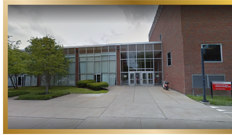
MILLER INFORMATION TECHNOLOGY BUILDING 2315 S 1ST ST | VISITOR PARKING AVAILABLE

Business Operations will reach out to you via email to complete your I-9 and payroll information. You must complete the I-9 no later than 3 days from your start date.