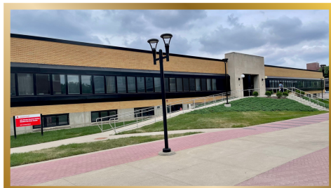
HOUCHENS BUILDING 2211 S BROOK STREET | METERS AVAILABLE ON SIDE OF BUILDING FACING RAILROAD TRACKS

You can pick up your UofL employee ID badge, called the Cardinal Card , in the Houchens Building on Belknap campus.