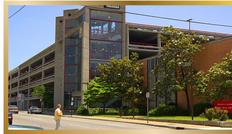
CHESTNUT STREET GARAGE 414 E CHESTNUT | METERS AVAILABLE ON CHESTNUT ST.