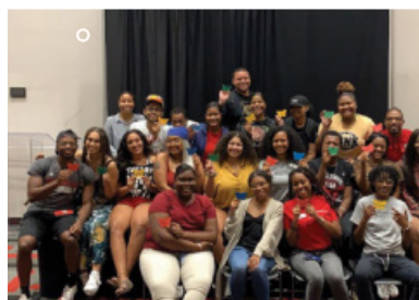
Ali Scholars were featured in the November 2021 Insight Into Diversity magazine for social justice and activism.