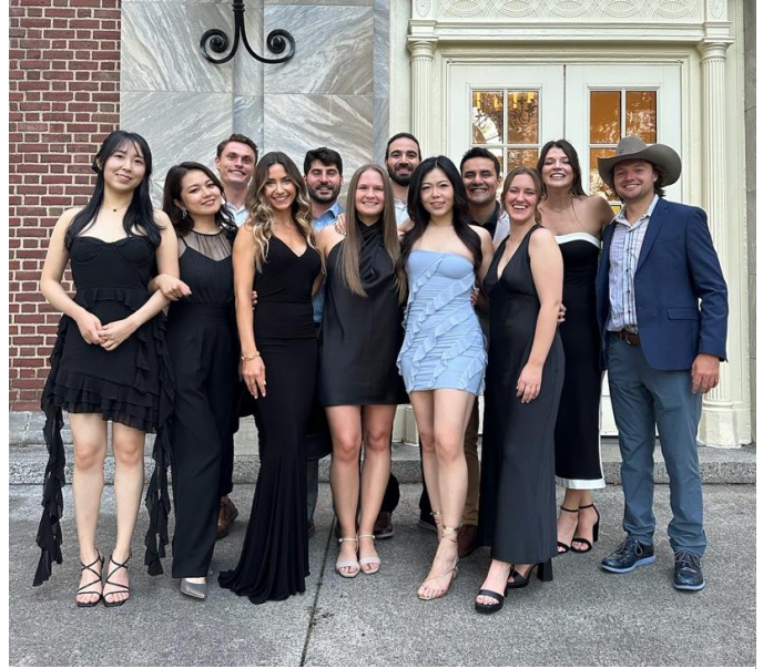
Residents at GORP '24

We feel this support as we work on patients in our alumni donated dental chairs, and soon to be a newly renovated clinic. We feel fortunate and grateful to have support for our learning excursions, where we have the unique opportunity to attend lectures and expand our education, meet celebrated colleagues in the field, and make unforgettable memories with our coresidents and faculty. We had opportunities to attend GORP, KAO, UofL Alumni Meeting, AAO, and Tweed.