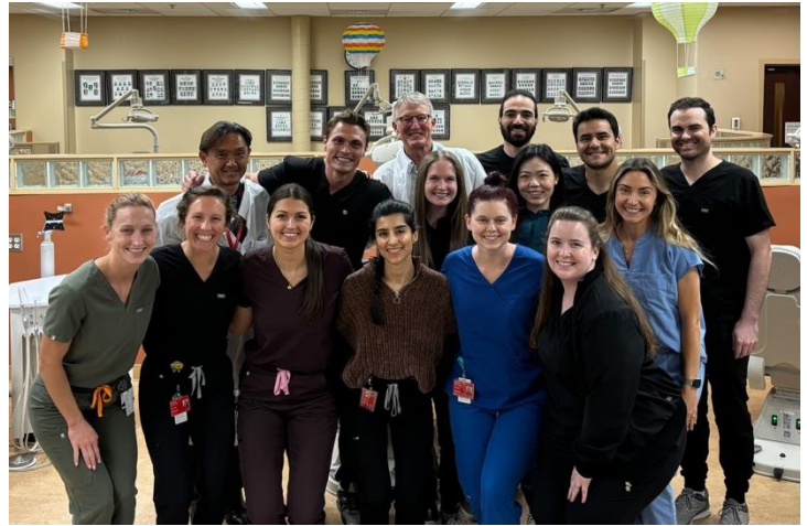
Recent '24 Graduates with now Senior Residents

We are so grateful for each and every one of our alumni. You help us feel a part of the bigger picture. We have learned valuable tools, formed meaningful relationships as mentees, colleagues, and friends. And we very much look forward to joining you all as alumni in the near future.