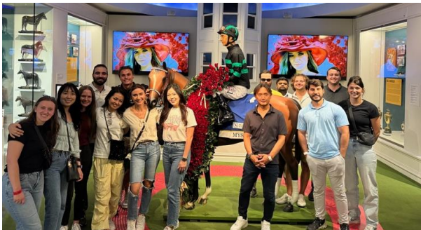
Residents at Churchill Downs

The Tweed course in Tucson, Arizona is a most recent addition to our program, and not only did we form arches there (yes, we developed such amazing wire bending skills our fingers were raw), but we also formed special memories and new relationships.