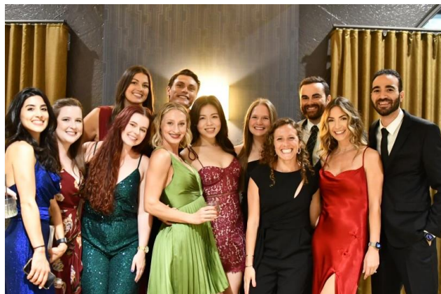
Residents at GORP

Additionally, we have felt immense support for our program in the form of donated time and knowledge from our incredible faculty, guest lecturers, and many who have allowed our residents to shadow their offices. This has provided us the opportunity to learn so many perspectives in business, clear aligners, employment transitions, treatment planning, and to make stronger connections with our alumni.