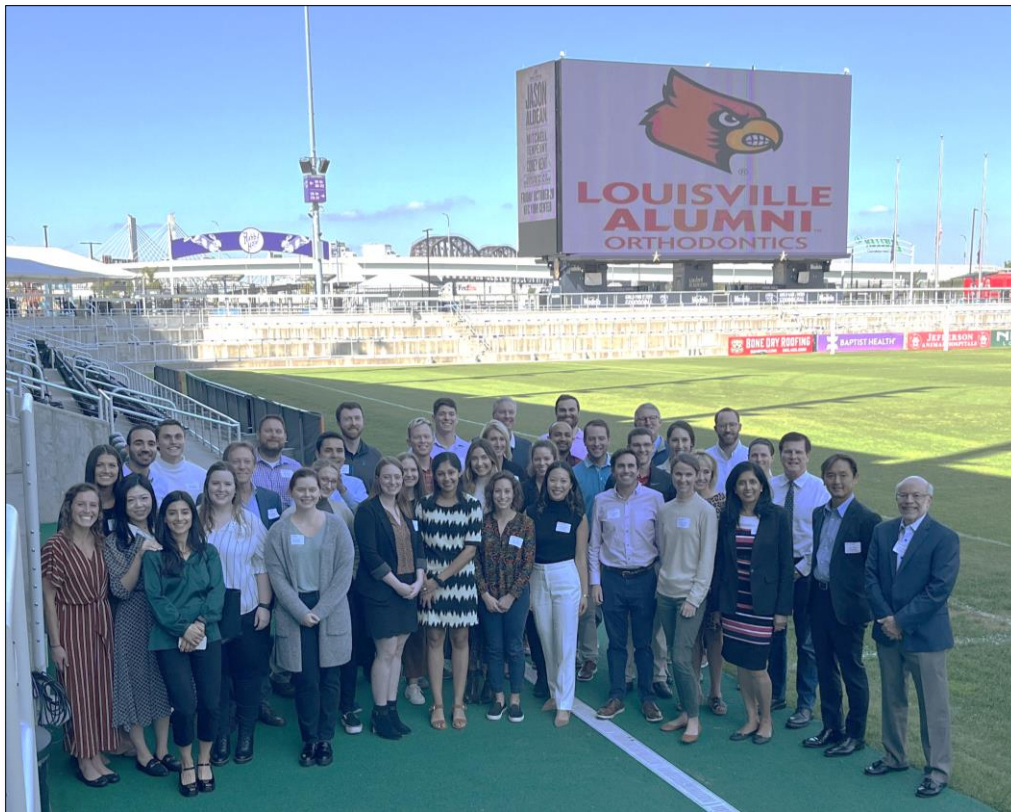
2023 Annual Meeting at Lynn Family Stadium