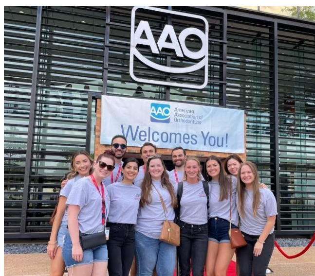
Current residents at AAO.

We are all so grateful to each one of you. During our time in residency, we have all learned so much, formed relationships with incredible mentors, and made lifelong friends and colleagues, and we cannot wait to join you as alumni in the coming years.